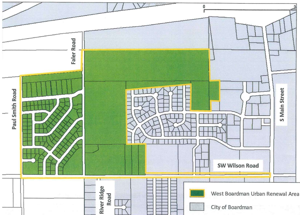
FIGURE 2.1: WEST BOARDMAN URBAN RENEWAL AREA, BOARDMAN

https://satellites.pro/Boardman_map.Oregon_region.USA