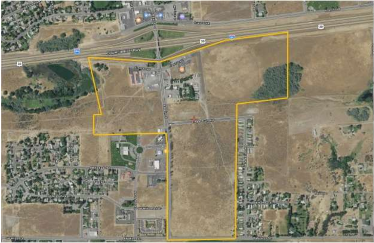
Boardman Central Urban Renewal Satellite Map 2017

https://satellites.pro/Boardman_map.Oregon_region.USA