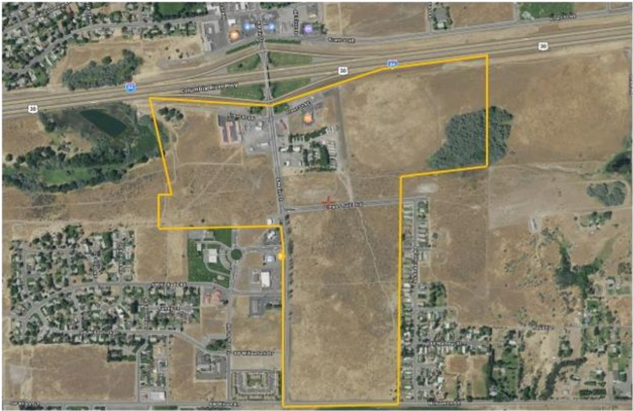
Boardman Central Urban Renewal Satellite Map 2017

https://satellites.pro/Boardman_map.Oregon_region.USA